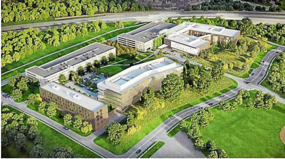
Penn Medicines Radnor Complex Rendering