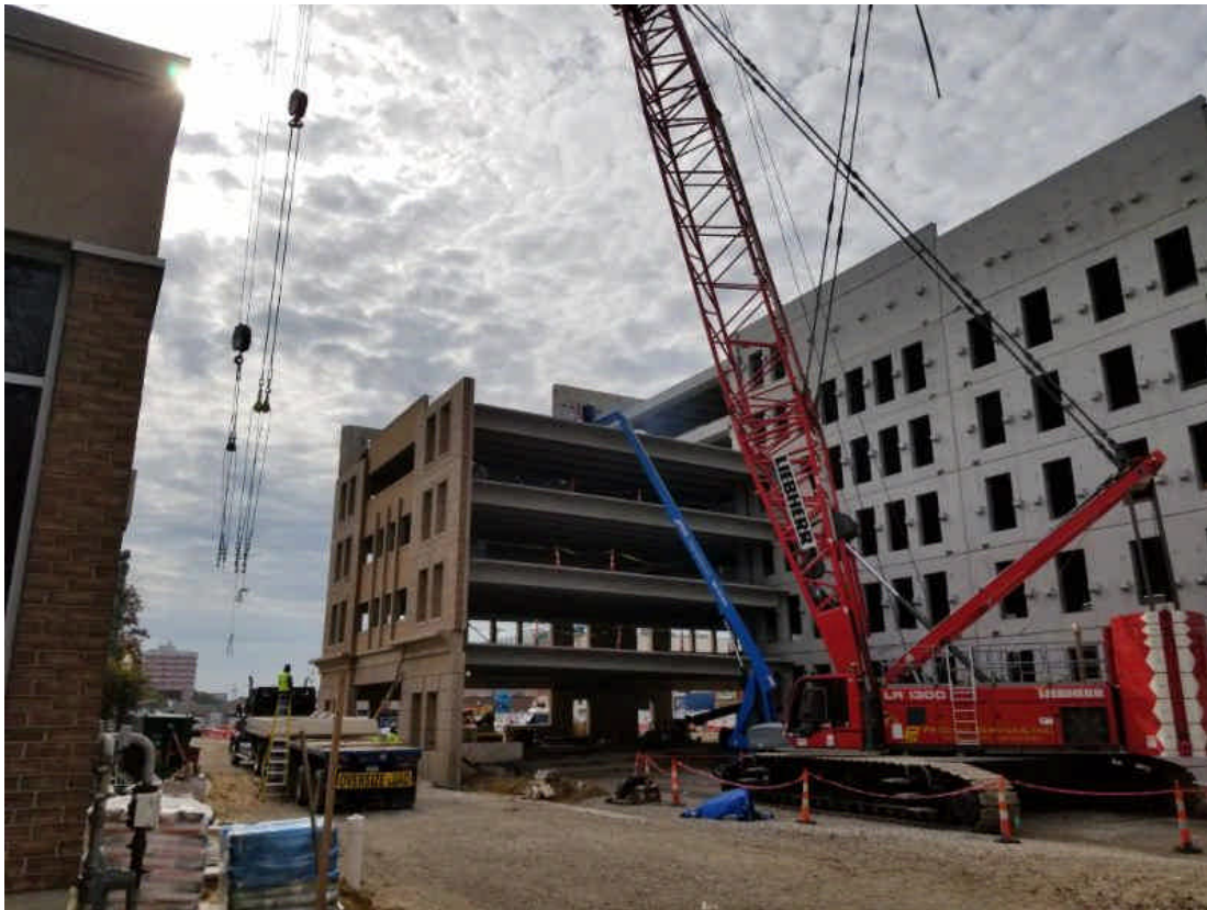
The 11 Mile PG located in Royal Oak, Michigan is looking good and is approximately 65% complete. Expected completion date is December 7, 2018.